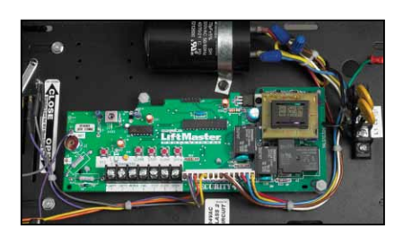
Includes the Medium-Duty Logic Board with Built-In Receiver